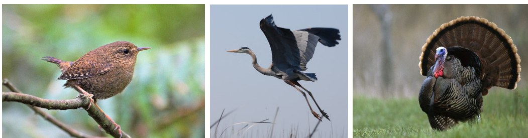
For each of these birds, is the “size” large or small? Is the degree of “stoutness” large or small?

Now, what does the second principal component mean? It is mostly influenced by wingspan and weight, as these entries in \vec{u}_2 have the greatest absolute values. However, they also have opposite signs. This indicates that \vec{u}_2 describes a feature of birds corresponding to relatively small wingspan and large weight, or vice versa. We might call this quality “stoutness.”